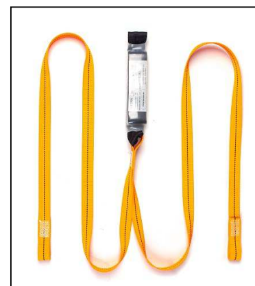
TX/L2 shock absorber with lanyard