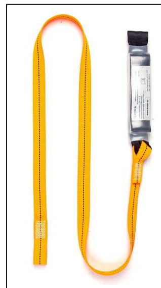
TX/L1 shock absorber with lanyard