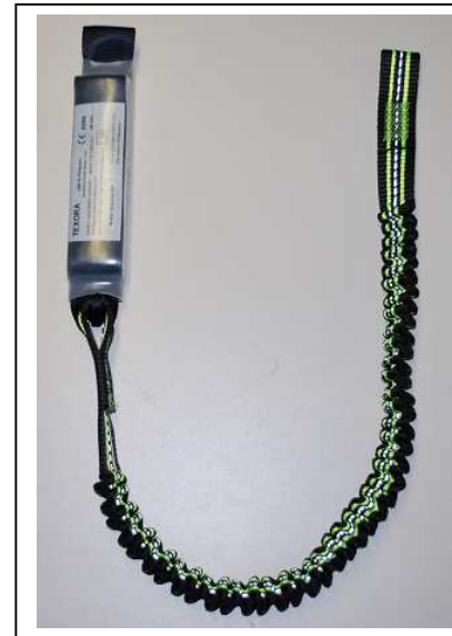
TX/L1 REFLECT shock absorber with lanyard