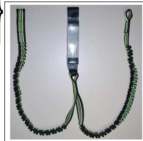
TX/L2 REFLECT shock absorber with lanyard