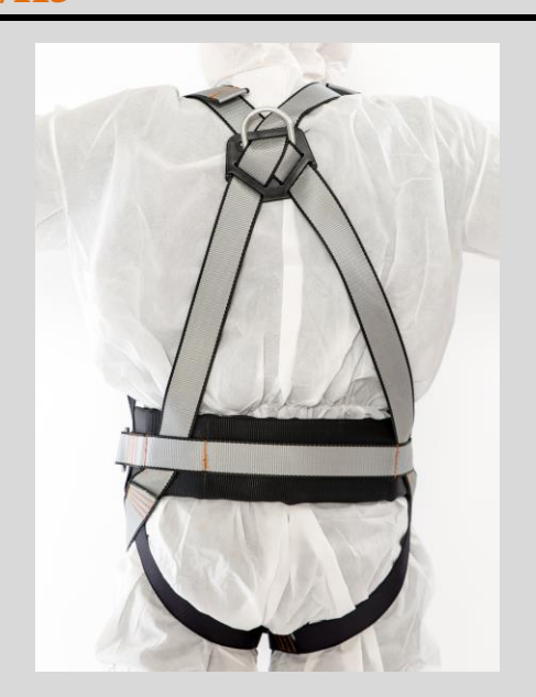
This 5-Point harness combines simple and ergonomic harness with a comfortable work positioning belt, two-in-one.

The harness is fitted with a rear D-ring and two rings mounted to the belt for pole climbing or can also be used for work positioning on various open structures. It also has 2 front loops as attachment points.